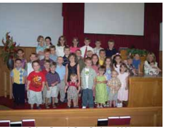
Bybee Branch Pew Packers 2006