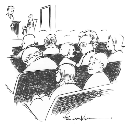
"GRANDMA, YOU SAID WE DIDN'T HAVE TO TAKE A NAP IF WE WENT TO CHURCH, BUT GRANDPA'S TAKING ONE"

All ladies of the congregation are invited to the annual Ladies Holiday Party on Thursday, December 6 at 5:30 pm at Medley's Diner. More information is on the bulletin board. Deadline to sign up will be Sunday, Nov. 25.