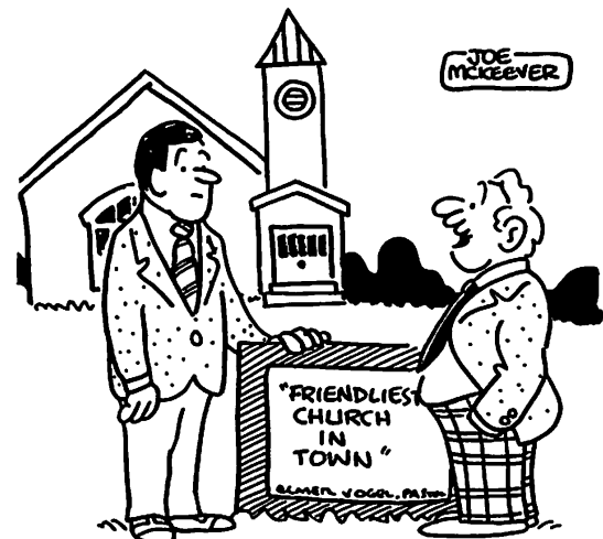
WHAT WILL YOU DO IF SOMEONE STARTS ANOTHER CHURCH IN THIS TOWN ?*

The Evangelism class meets this coming Sunday at 5 pm.