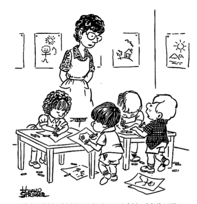
"OF COURSE NOBODY KNOWS WHAT GOD LOOKS LIKE. HAVEN'T FINISHED DRAWIN' HIS PICTURE YET."